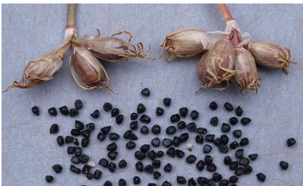
Bulbs and seeds

Plants need light, water and warmth to grow and survive.