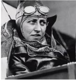
Amy Johnson flew to Australia 1930