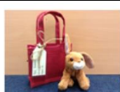
Rebecca Rabbit The right to nutritious food