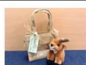
Derek Deer The right to clean water