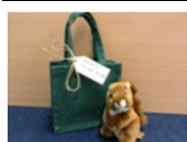
Sammy Squirrel The right to play