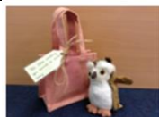
Ollie owl The right to an education