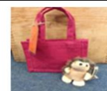
Harry Hedgehog The right to reliable information