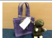
Marty Mouse The right to a shelter