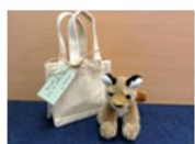
Freddie Fox The right to a family