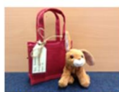
Rebecca Rabbit The right to nutritious food