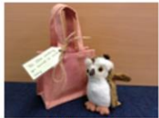
Ollie owl The right to an education