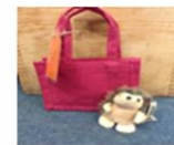
Harry Hedgehog The right to reliable information