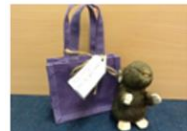
Marty Mouse The right to a shelter