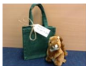
Sammy Squirrel The right to play