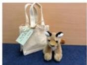
Freddie Fox The right to a family