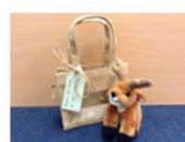
Derek Deer The right to clean water